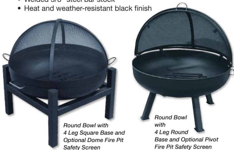
Round Bowl with 4 Leg Square Base and Optional Dome Fire Pit Safety Screen