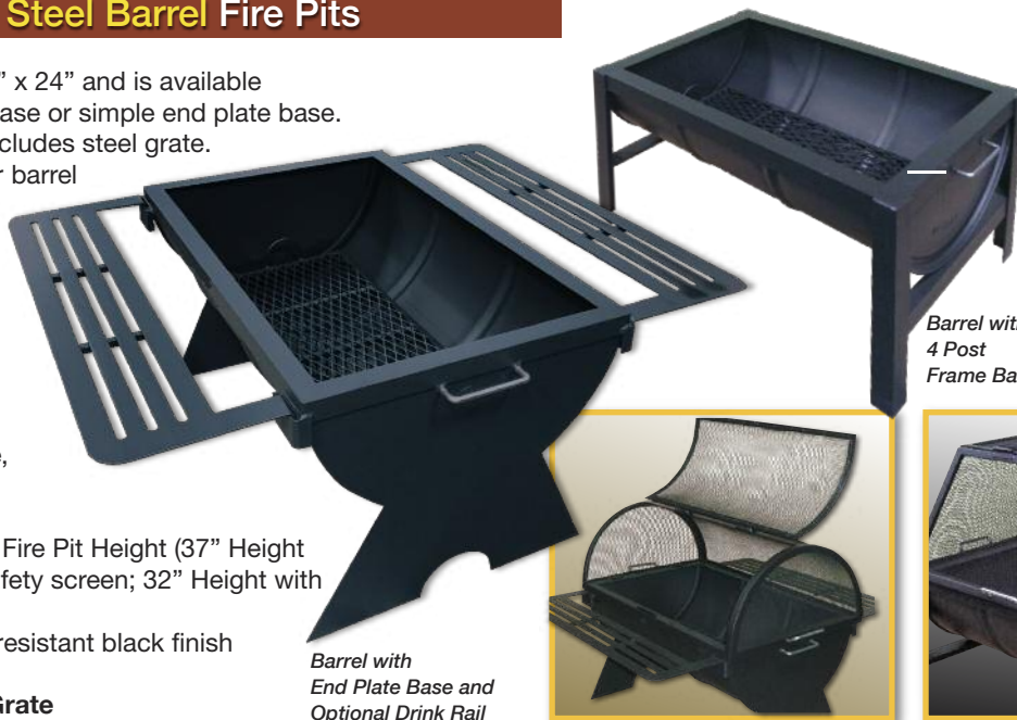
Barrel with End Plate Base and Optional Drink Rail