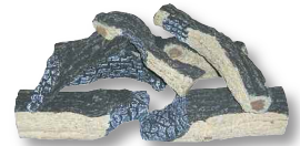
CHARRED SPLIT OAK